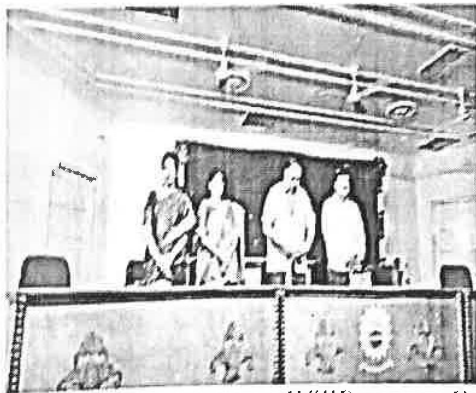
WillPower to EmPower" on 30 th , November 2022