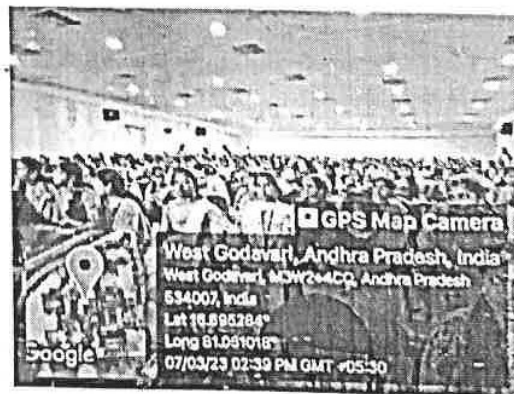
International Women's Day was celebrated at Sir C R Reddy College Of Engineering On March 7 th 2023