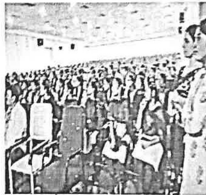
WillPower to EmPower" on 30 th , November 2022