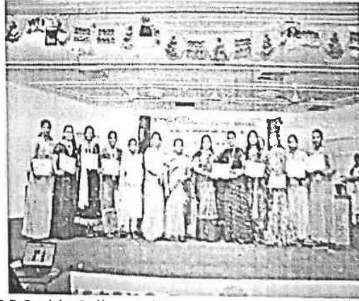
International Women's Day was celebrated at Sir C R Reddy College Of Engineering On March 7 th 2023