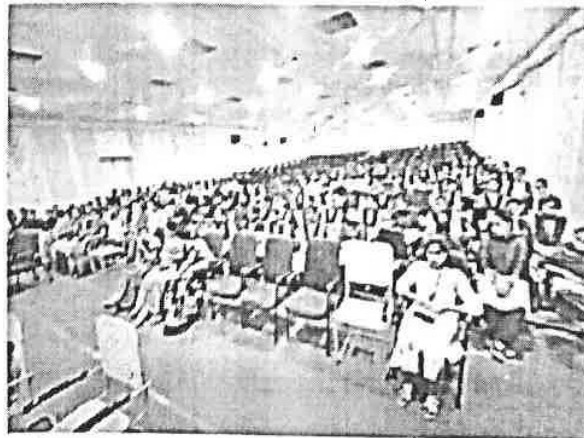
WillPower to EmPower" on 30 th , November 2022