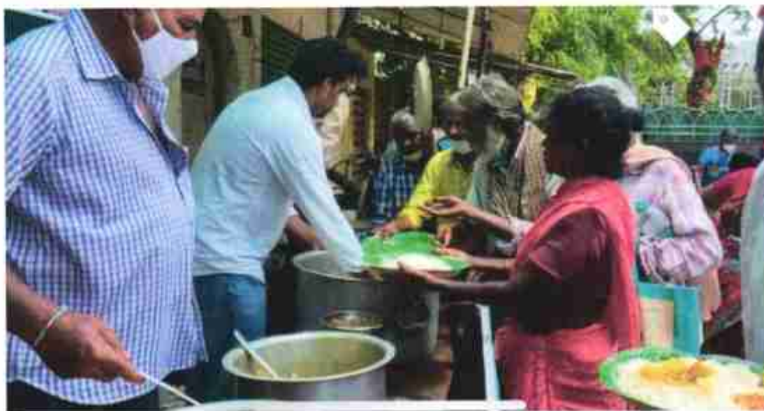
FOOD DONATION TO THE POOR