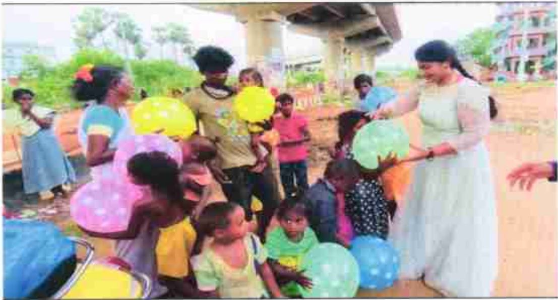
BALOONS AND TOYS DISTRIBUTION TO THE POOR KIDS