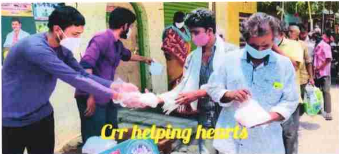
FRUITS DISTRIBUTION TO THE NEEDY