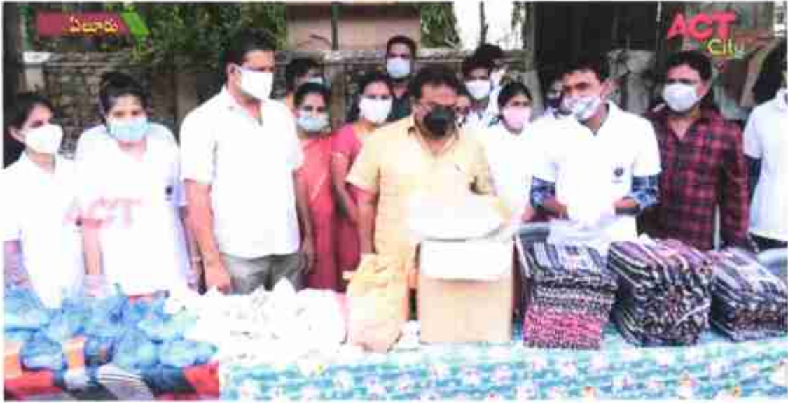
MEDICINES AND BLANKETS DISTRIBUTION TO THE NEEDY