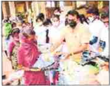
పంపిణీ చేస్తున్న పిడకాలు

కార్యక్రమంలో ముప్ప ముప్పొడుతుడు నేకే వాటికే తరలించు వాళ్ళిన్నారు. • కేడికే తాగేముడి ముప్ప ముడితే అవసరంలో కేడికే తాగేముడి అలంకారం నుడియకుండు అలా.నా.కాం. ముప్ప ముప్పొడు. కార్యక్రమం కుడవారు ముడితే తీకాం. ఆన్. నే.నా.కే. ముప్ప అధ్యక్షుడు. కిక్రవా వాటికే అధ్యక్షులలో కుడి.నా.సి.సి. కార్యక్రమంలో కుడి.నా. సి.సి. తరలించు వాళ్ళిన్నారు.